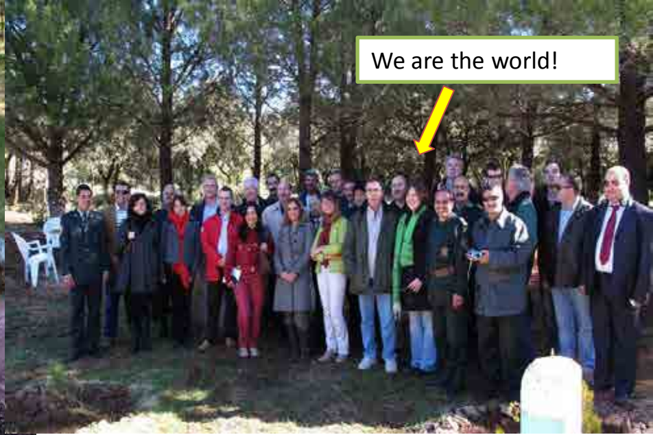
We are the world!