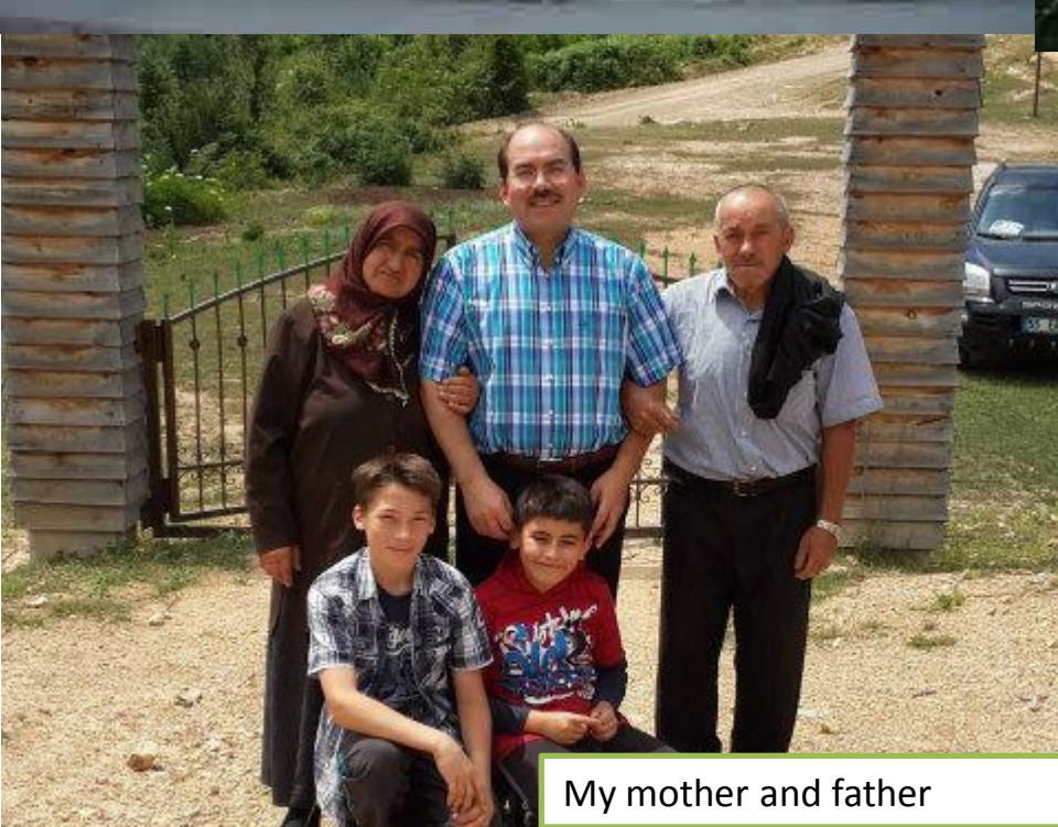
My mother and father