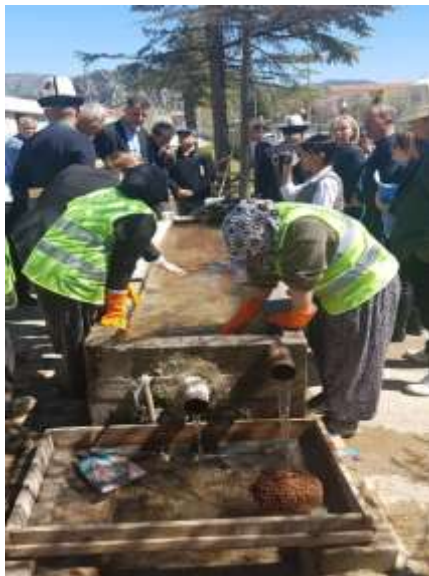
Figure 30 Eğirdir Forest Nursery