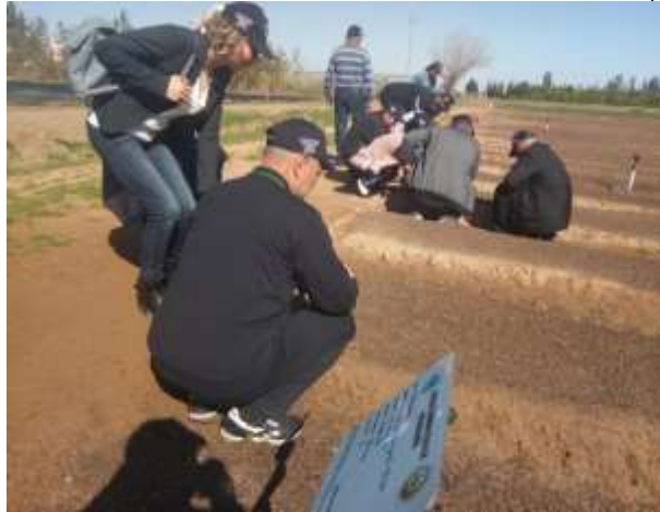
Figure 16 Antalya Forest Nursery-I