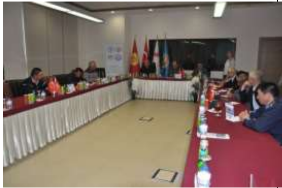
Figure 18 Picture of 24th of March