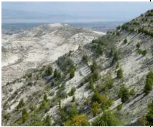
Figure 32 Burdur's Afforestation Sites