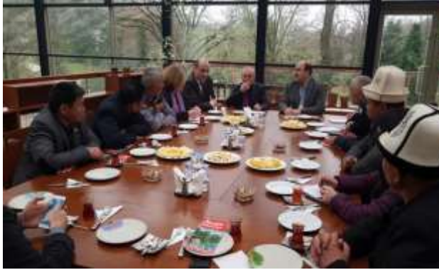
Figure 5 Field trip at Istanbul Arboretum