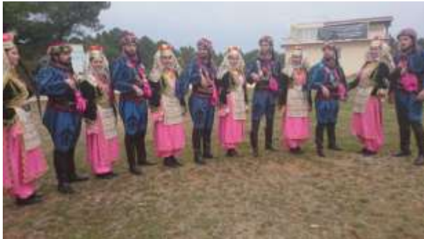
Figure 8 Ceremony of 21st of March IDF