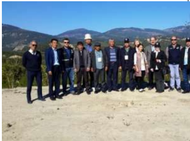
Figure 26 Field trip to Bucak Forest Directorate