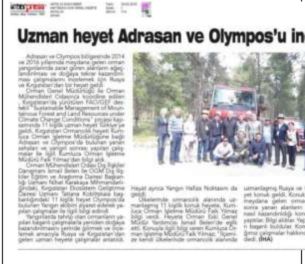
Figure 34 News on a local newspaper