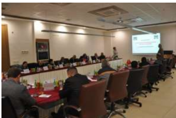
Figure 20 Meeting with NGOs