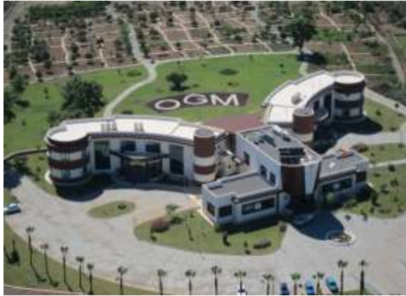
Figure 14 International Training Center of Antalya