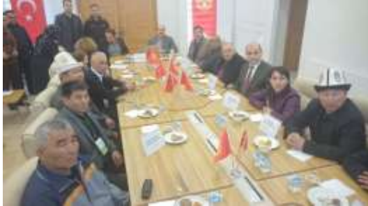
Figure 6 Meeting at Istanbul Nursery