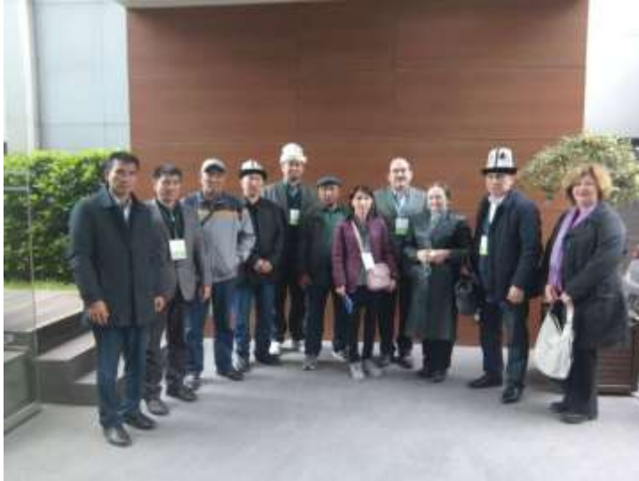
Figure 1 First Day of the Program

After lunch, the Atatürk Arboretum of the Istanbul Regional Directorate of Forestry, was visited. This arboretum, created with hundreds of domestic and foreign tree species, is considered as a good example for the afforestation studies.