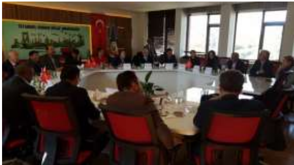
Figure 12 Regional Directorate of Istanbul