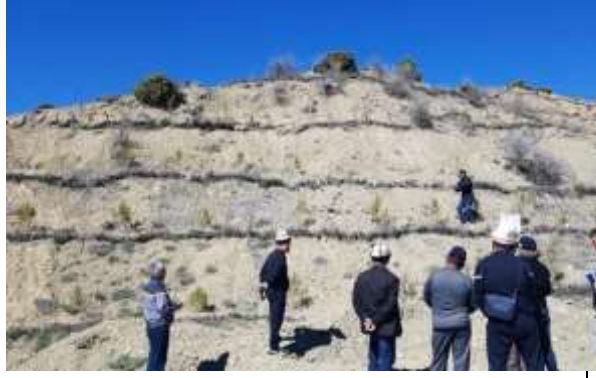
Figure 24 Field trip to erosion control sites