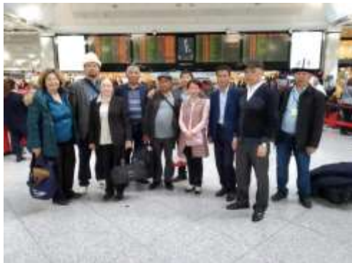
Figure 36 Depart to Bishkek from Istanbul