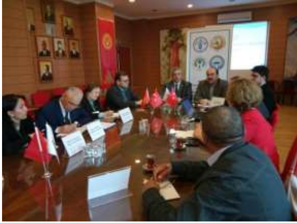
Figure 10 Istanbul Faculty of Forestry