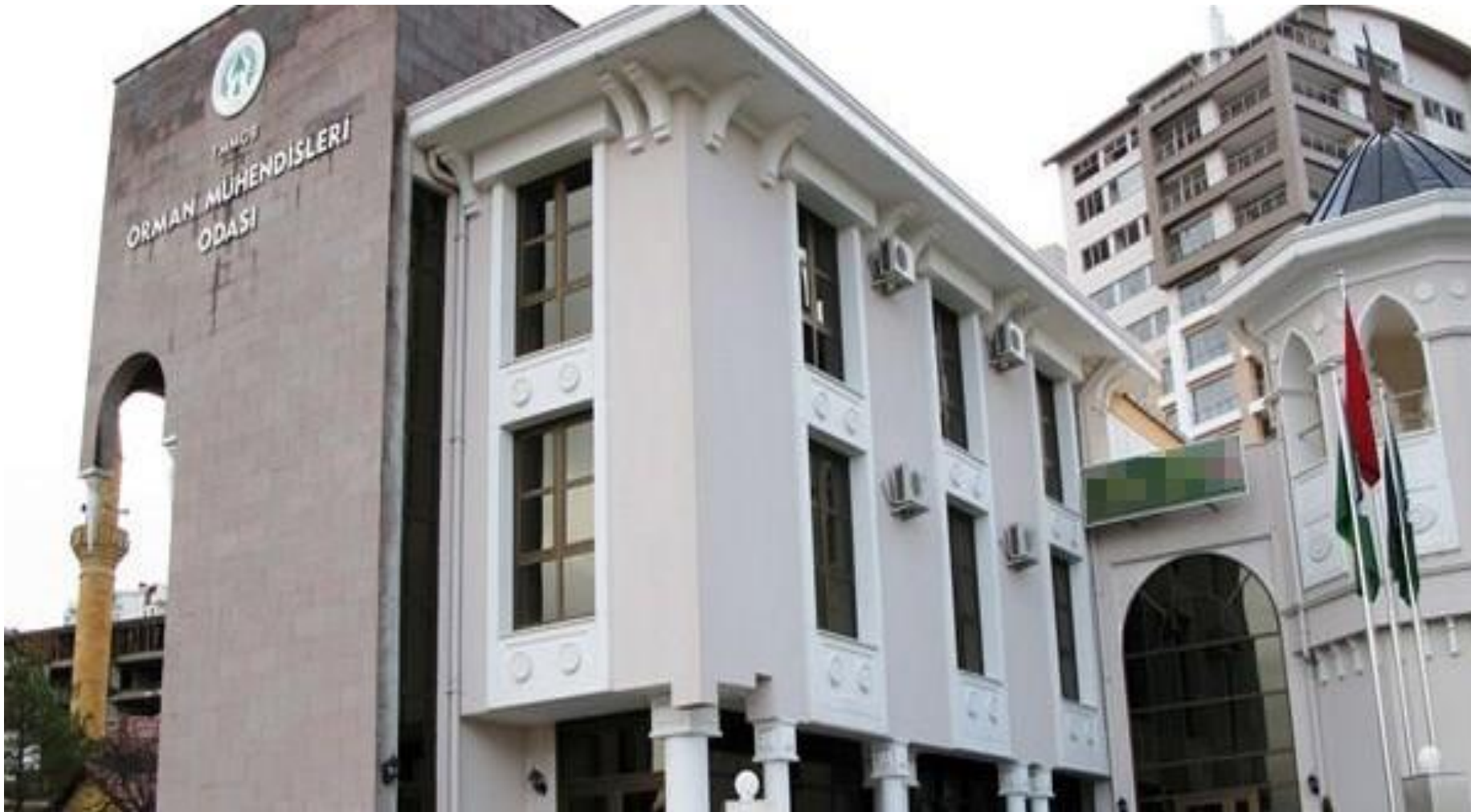
The Headquarter of the Chamber of Forest Engineer Ankara/Turket