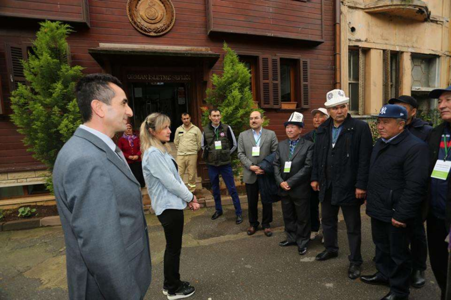
Training program on forest pest and diseases for Kyrgyz forester