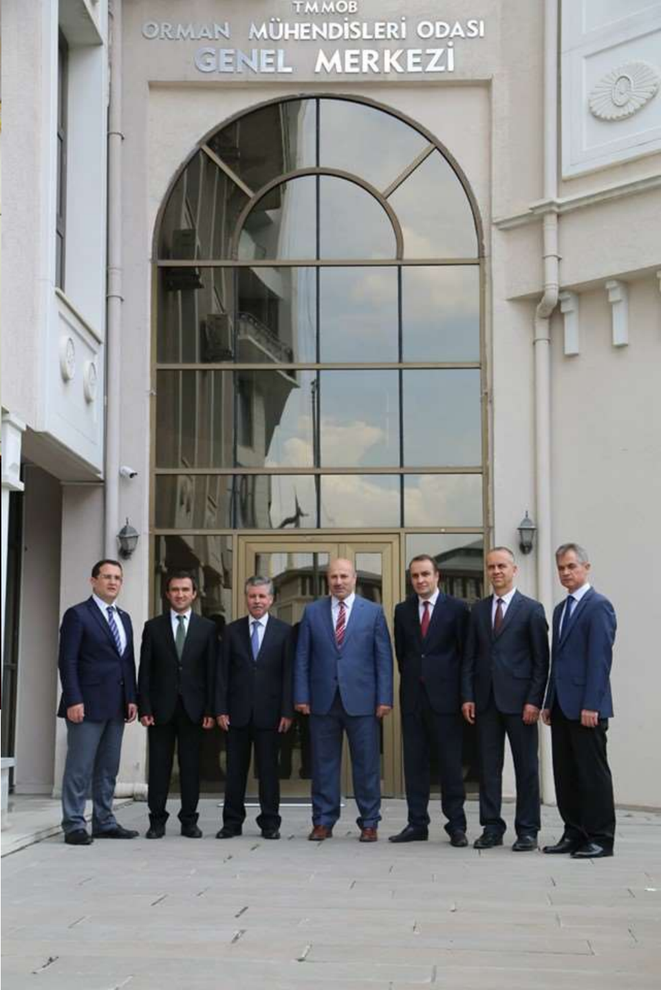
Ankara with the Minister of Agriculture and Forests