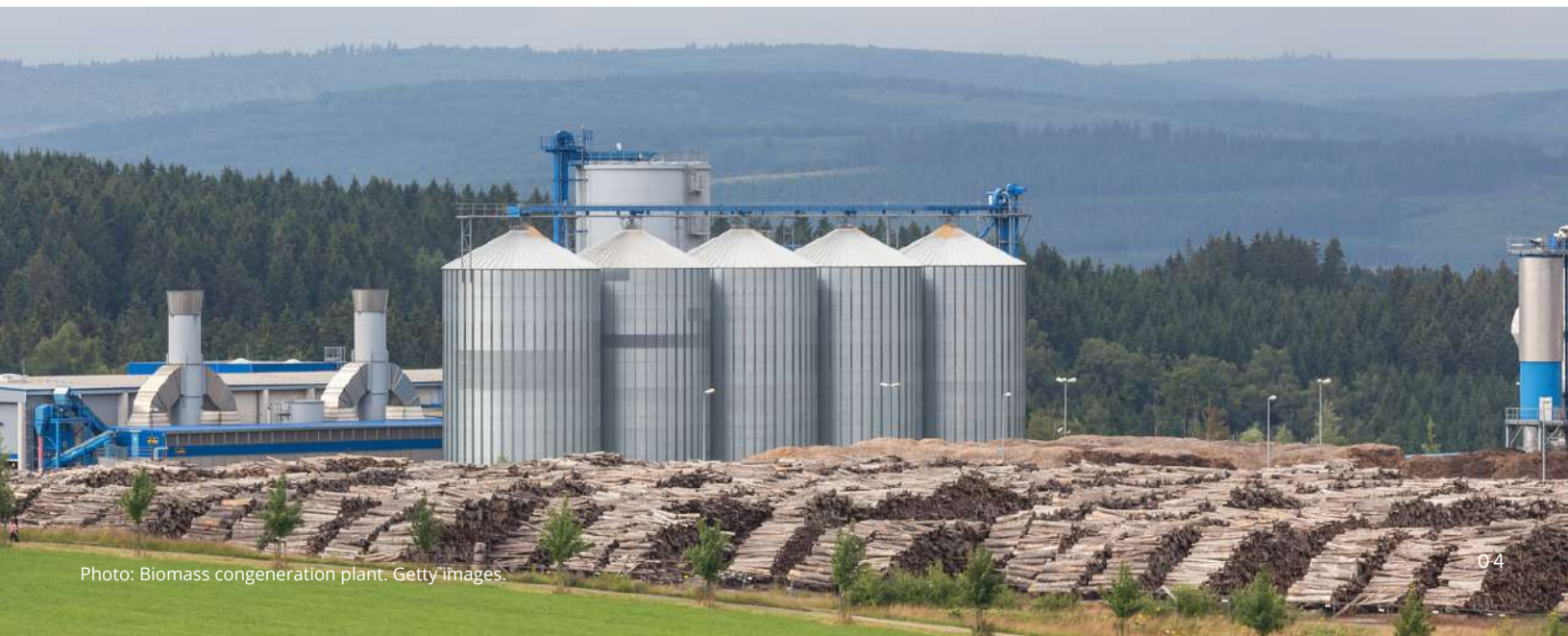
Photo: Biomass cogeneration plant.

Biomass is supplying 25% of the total material demand, comprising organic materials such as food crops, meat and dairy products, and a host of forest and other biomass products.[10] Biomass used for energy is used most often for producing heat. It can be considered climate neutral and a renewable energy source when its use does not lead to a net reduction in global forest area or plant cover that would in turn reduce the function of the Earth’s natural biological carbon sinks. This means that the availability of biomass that can sustainably be used in the energy system is finite; there is a limit to the share of the global renewable energy supply that can be supported by biomass.[11]