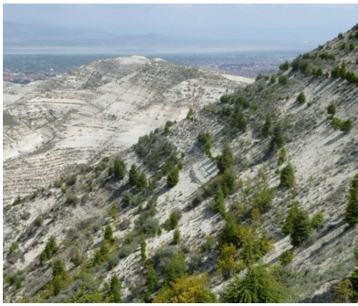
Figure 32 Burdur's Afforestation Sites