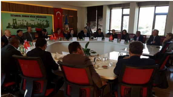
Figure 12 Regional Directorate of Istanbul