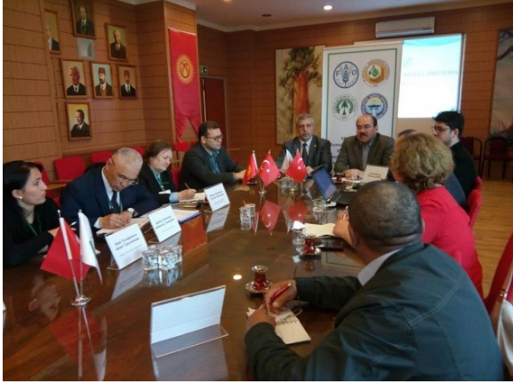
Figure 10 Istanbul Faculty of Forestry