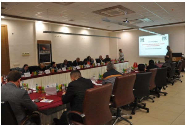
Figure 20 Meeting with NGOs