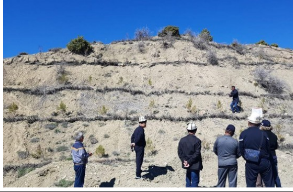
Figure 24 Field trip to erosion control sites