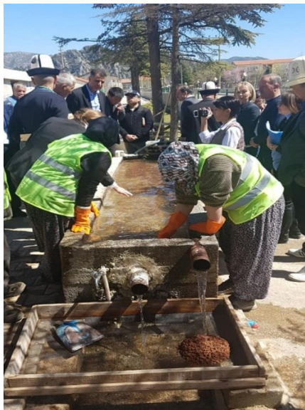
Figure 30 Eğirdir Forest Nursery