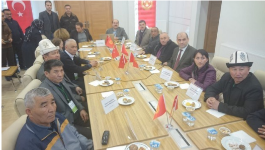
Figure 6 Meeting at Istanbul Nursery