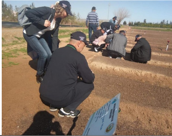
Figure 16 Antalya Forest Nursery-I