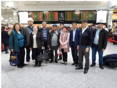
Figure 36 Depart to Bishkek from Istanbul