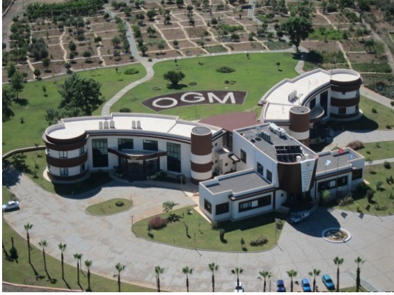
Figure 14 International Training Center of Antalya