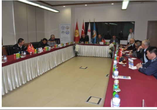
Figure 18 Picture of 24th of March