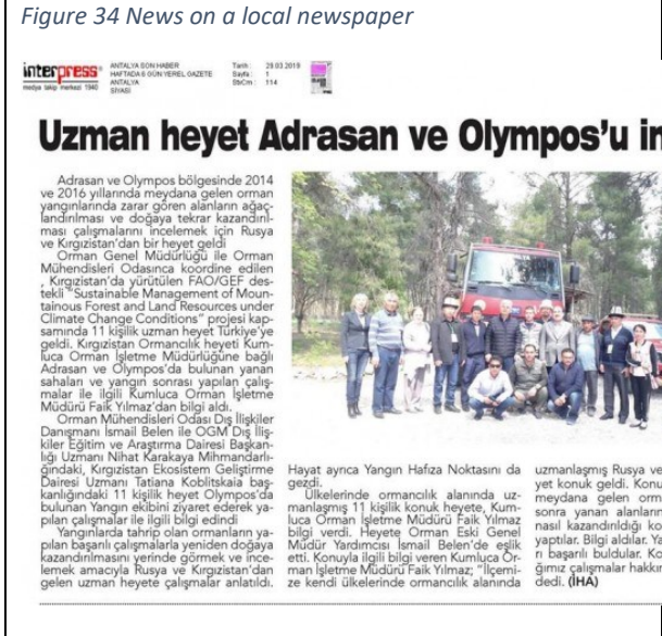
Figure 34 News on a local newspaper