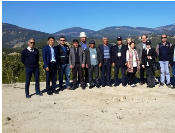
Figure 26 Field trip to Bucak Forest Directorate