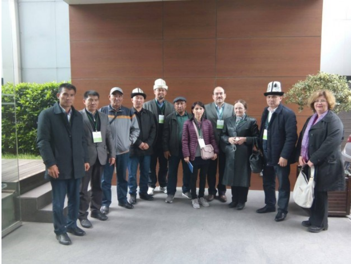
Figure 1 First Day of the Program

After lunch, the Atatürk Arboretum of the Istanbul Regional Directorate of Forestry, was visited. This arboretum, created with hundreds of domestic and foreign tree species, is considered as a good example for the afforestation studies.