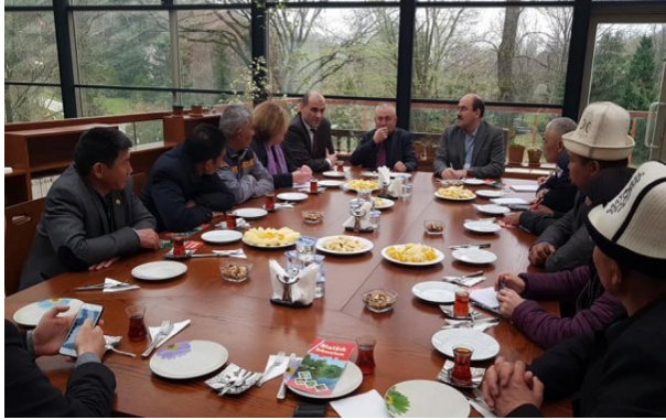
Figure 4 Meeting at Istanbul Arboretum