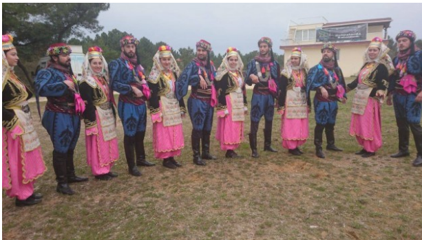
Figure 8 Ceremony of 21st of March IDF